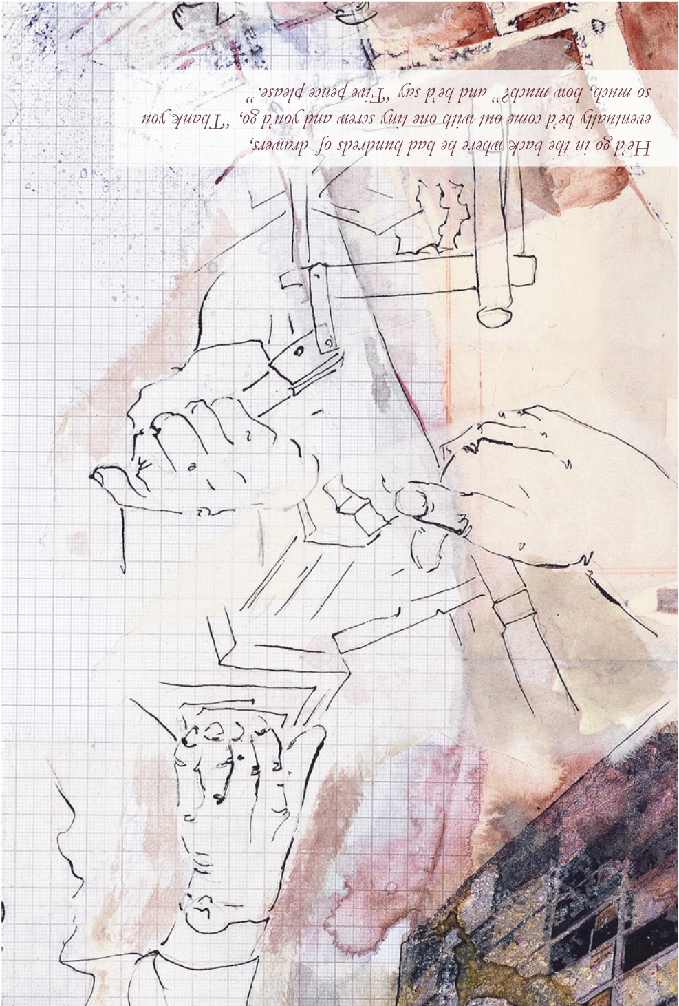
Held go in the back where he had hundreds of drawers, eventually he'd come out with one tiny screw and you'd go, "Thank you so much, how much?" and he'd say "Five pence please."