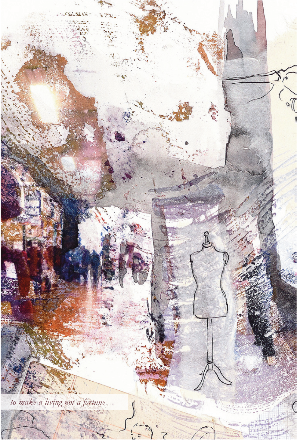
to make a living not a fortune