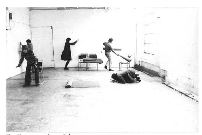
The Ting: An early workshop

"The Ting is a community of artists of all descriptions working within an arena of ritual coincidence in an attempt to build a ceremonial performance on a traditionally operatic scale of grandeur while adhering to the concepts that have spurred the development of theatre since the days of Artaud"