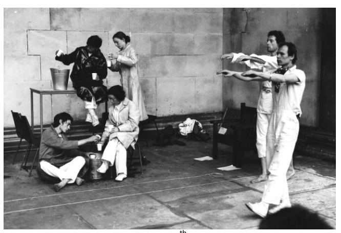
Two Journeys (The Slade, UCL, 27<sup>th</sup> May 1976)

vious direction (that is, performers start walking the new rotthis time walking backwards or revolving in a reverse of the preend of the line to choose for performance any of circles, but moving fastest in any rotation directs the performer at the other The first personal subject pronoun shouted twice by a performer