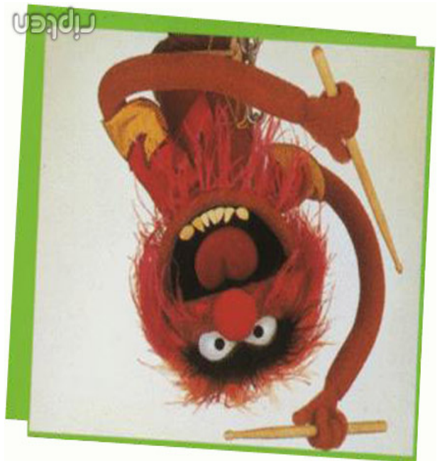
27 Drums, the long one wanders... i heart drums be- cause.

life is a heartbeat stuck in a drum.. thinking of drums and walking.