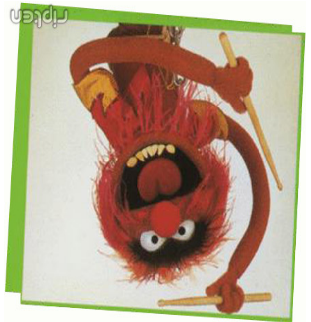
27 Drums, the long one wanders... i heart drums be- cause.