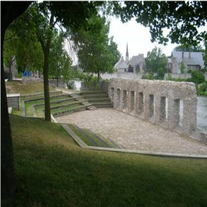
The Theatre InspiredMill Landscape (Before)