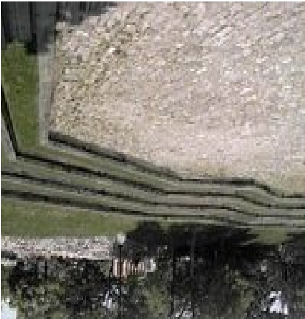
The Theatre Sitting (Before)