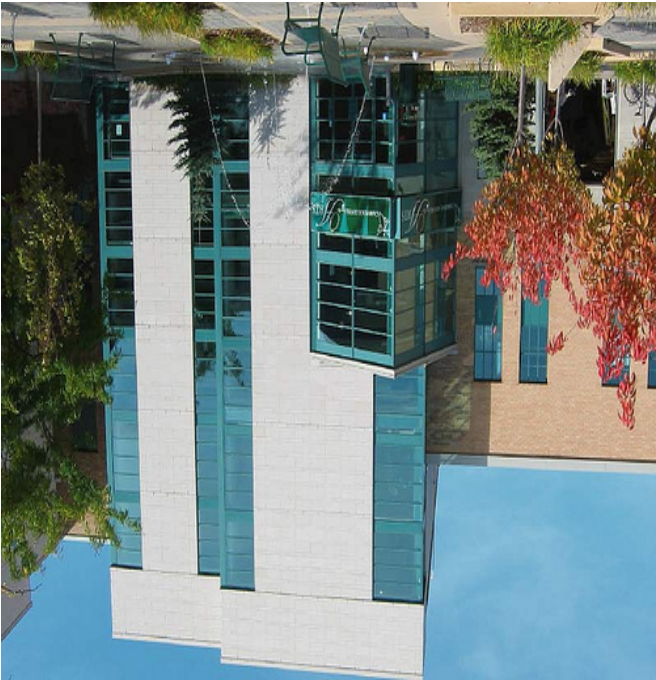
Cambridge Centre for the Arts Entrance

As for Cambridge's bad reputation for being a lame town, it's what you make of it. I've lived here for my years of life and have never heard of such events like the Mill Race or Rock the Mill music festivals; which takes place in Galt area of Cambridge. The Mill Race, takes place on an outside amphitheatre, naturally created through the ruins of the old mill, hence the Mill Race Festival. It is a free admission folk music and dance concert along with arts and crafts. While Rock the Mill, more popular among teens, was created by the Fiddlesticks community centre, where groups of local teen bands unite to play to fund raise for the centre.