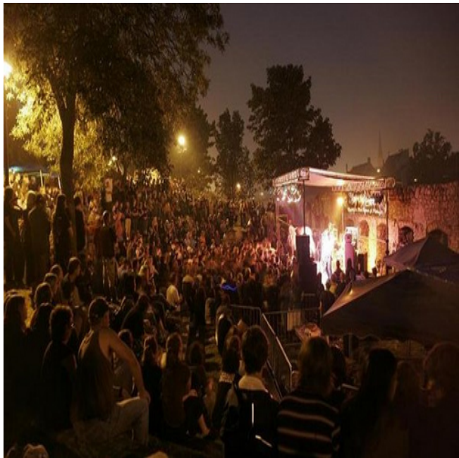
The Theatre Inspired Mill Landscape (Rock the Mill 2007)