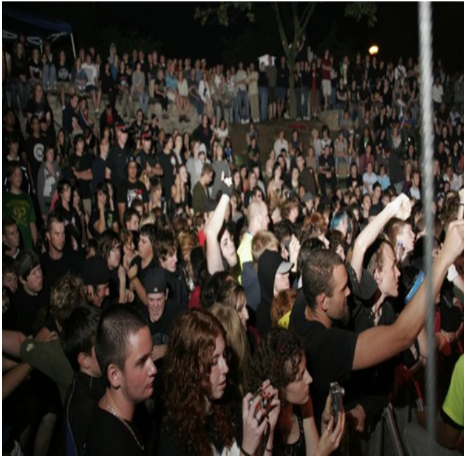
The Theatre Sitting (Rock the Mill 2007)