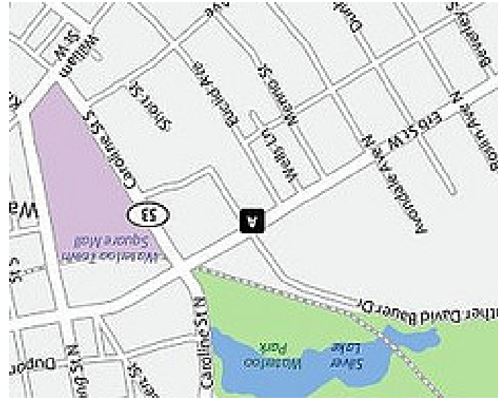
Map to Sole