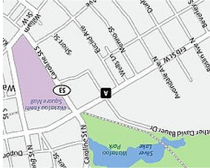
Map to Sole