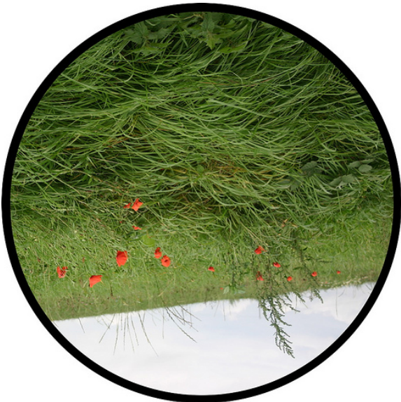
The Somme Battlefield (2006)