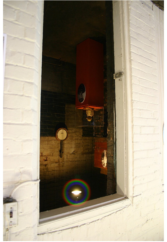
TH&B installation, Hamilton, Ontario, 2008

The ballad reproduced here provides the basic narrative, yet contains one significant