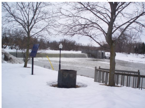
Nith River dam, higher then usual.