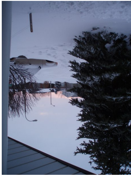
The journey starts on my front porch....

This book documents the journey I took walking and driving around my hometown of New Hamburg and is a reflection of my community these past few days. The photos are paths in town I walked on as a child and places that had great meaning to me, as well as others. They are the common places that create bonds between people. Institutions where recreational and leisure activities take place such as sports, restaurants and hangout spots, education and learning such as schools, businesses and places of work, and faith and religious practices such as churches.