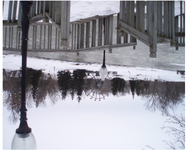
New Hamburg Water Wheel

Huron street down town NH. Hotels were the main businesses for the first century of the community's life, starting in the 1850's. Local transportation consisted of horses.