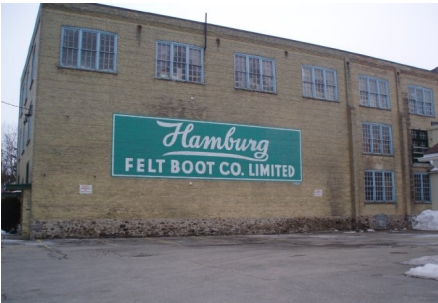
Old Factory still in existence.

It has a rich heritage and is full of interesting history. This is what makes it so unique and ties people to this town. It is growing into a contemporary rural town with new developments and constant changes. New Hamburg is creating its newly formed identity which history will record.