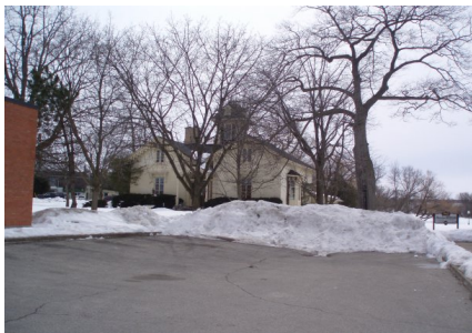
The Waterlot, known restaurant by outsiders.