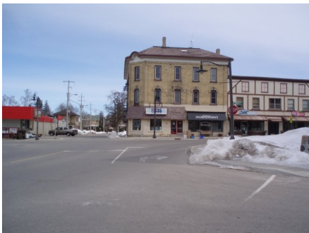
Local Newspaper, other businesses and apartments keep the town prospering. Formerly Queens Hotel in 1800s.