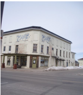
Local bar or commercial Hotel, Eddly's.